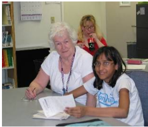
Participants in Chandler's "Literacy Connections" program.