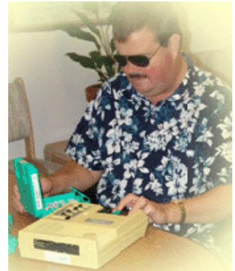
A Braille and Talking Book Library patron listens to a book.