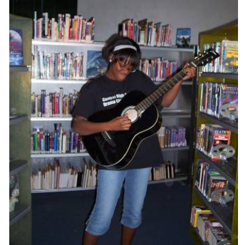
A student at Phoenix Public Library.

Arizona has a voter-funded initiative, First Things First, which is working with community partners to build a statewide system that grows and sustains a coordinated network of early childhood programs and services. Placing Brain Boxes in libraries aligns with a goal of the Arizona State Library to provide access to public information and to the vision of First Things First that "all Arizona children birth through age five are afforded opportunities to achieve their maximum potential to succeed in school and life."