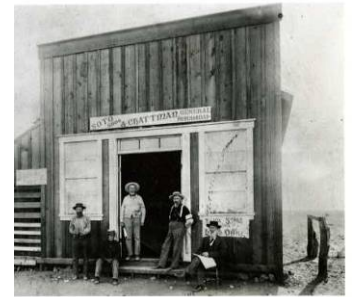
Men standing in front of store in Pearce in historic photograph from a digitization project.

The State Library encourages rural libraries to be a part of AZNET and assists in retro-conversion of existing catalogs. More than 11.6 million records from Arizona are on the WorldCat.