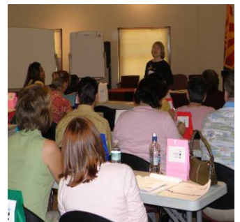
Library Development offers professional training across the state