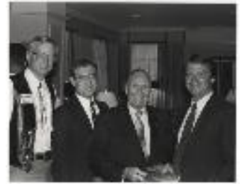
Scottsdale Charros Meet Gene Autry in this historic photo that Scottsdale Public Library has digitized.

Libraries are especially well-suited to host historic exhibits and sponsor programs, as well as open up access to historic collections through digital imagining and online access.