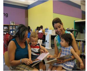
Moms reading to their children during the Itty Bitty Readers Program at Glendale Public Library.

LSTA funding provided the financial support needed to produce the discussion guide and curriculum material for the books, and to pay for the two authors to make personal appearances in Arizona cities to promote reading and discussion of the book. LSTA funding also purchased thousands of books for use the by the hundreds of partners that worked with the Arizona State Library to make ONEBOOKAZ happen.