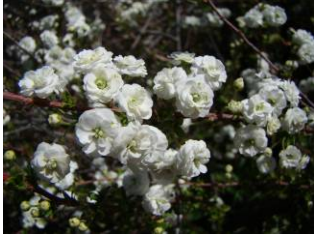
Spirea in Patagonia, Patagonia Library's Legacy Garden