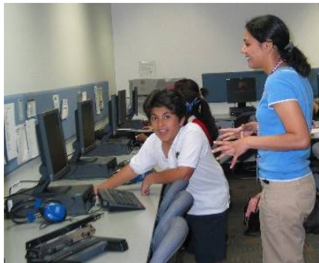
Students work in the learning laboratory at Chandler Public Library.