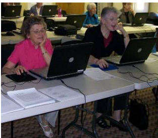
Two women work on their computer skills as a part of the Pine library's SOLO program.

project designation by the Arizona Historical Advisory Commission. The Arizona Centennial 2012 legacy projects support the Arizona State Centennial Celebration. This project is made possible in part by an LSTA grant to the Arizona State Library, Archives and Public Records.