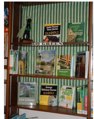
Winslow Public Library provides resources and programming on environmental topics.

“We will be able to implement a project that is fairly spectacular in terms of technology that will be readily visible to all people using the library, something that our rural, poorly funded libraries could only have speculated upon without much hope of being able to afford it.”