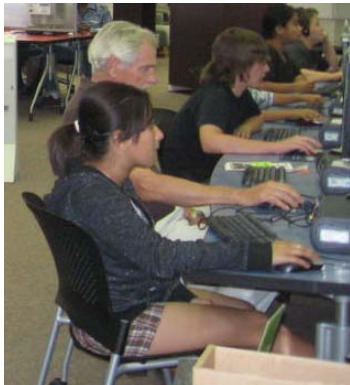
Computer users at Peoria Public Library.