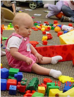
Even babies participate in library programs.

The Arizona State Library recognizes that children start school with disparities in their academic skills, and focusing primarily on school solutions is too late. The typical middle-class child enters first grade with 1,000 to 1,700 hours of one-on-one picture book reading, whereas a child from a low-income family averages just 25 hours. Almost half of public-aid parents report no alphabet books in the home, in