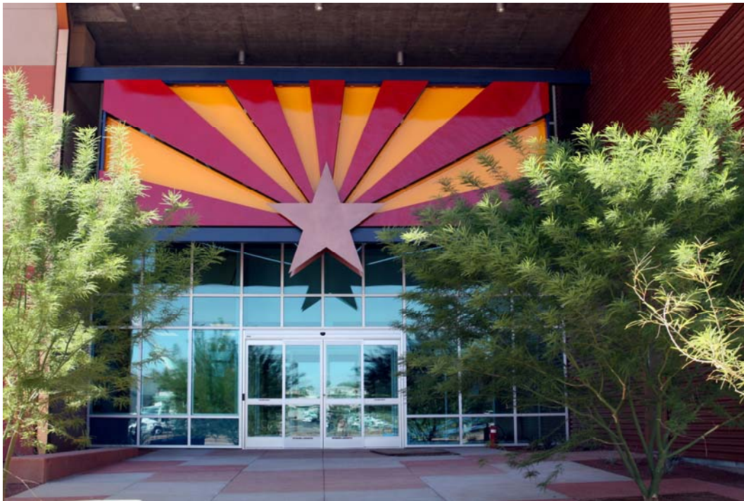
Entrance to the Polly Rosenbaum Archives and History Building.

...in the heart of the Archives Building one finds: 1) The Archives themselves, including historical records, photographs and permanent government documents; 2) The map collection, focusing largely on Arizona – from territorial days to the present; 3) The Arizona Collection, which has its origins in the 1864 territorial library. The books and magazines in the current collection range from Arizona history to old county budgets; 4) The Capitol Museum Collection. This pod stores artifacts not currently on exhibit at the Capitol Museum.